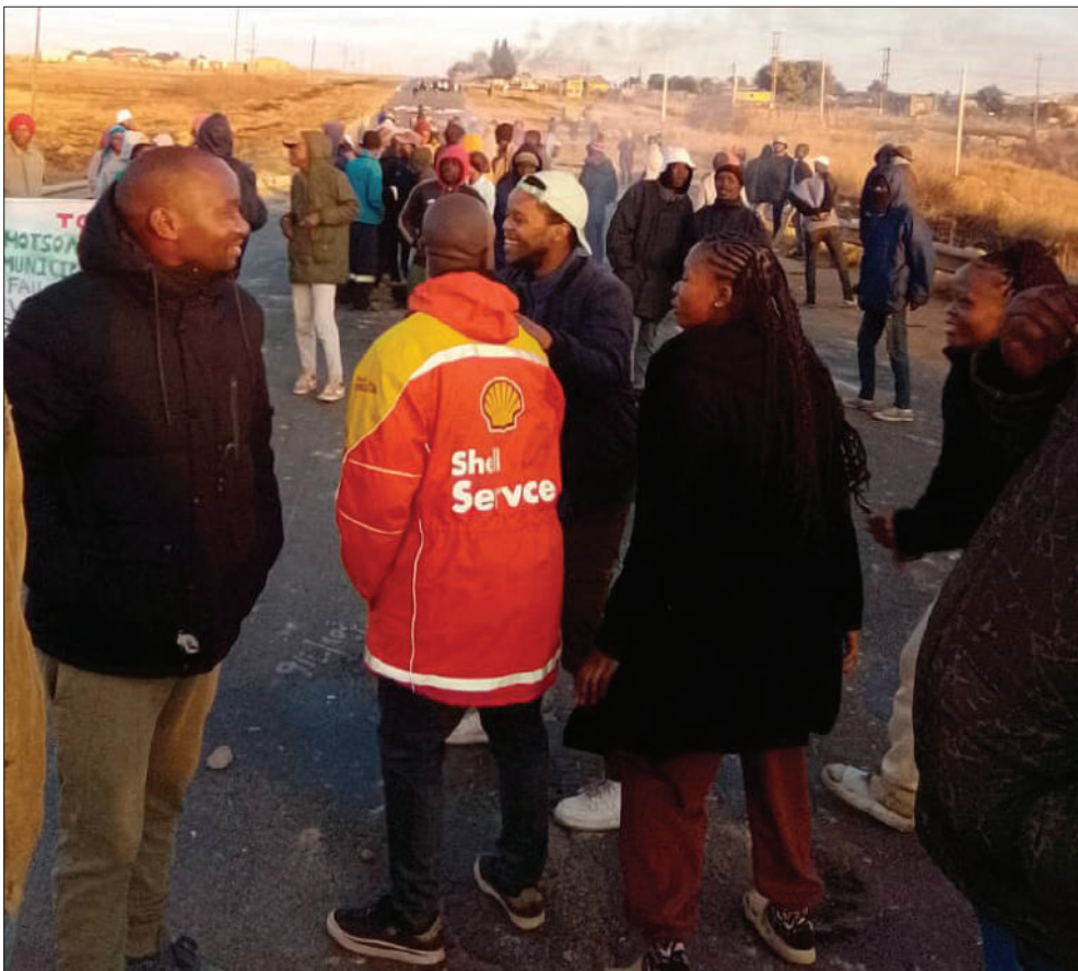
Luckau residents protesting and blocking the R574 Road demonstrating against poor service delivery in the area.

"We encourage residents to engage with us and provide feedback as we continue to enhance the quality of life in Luckau," he said.