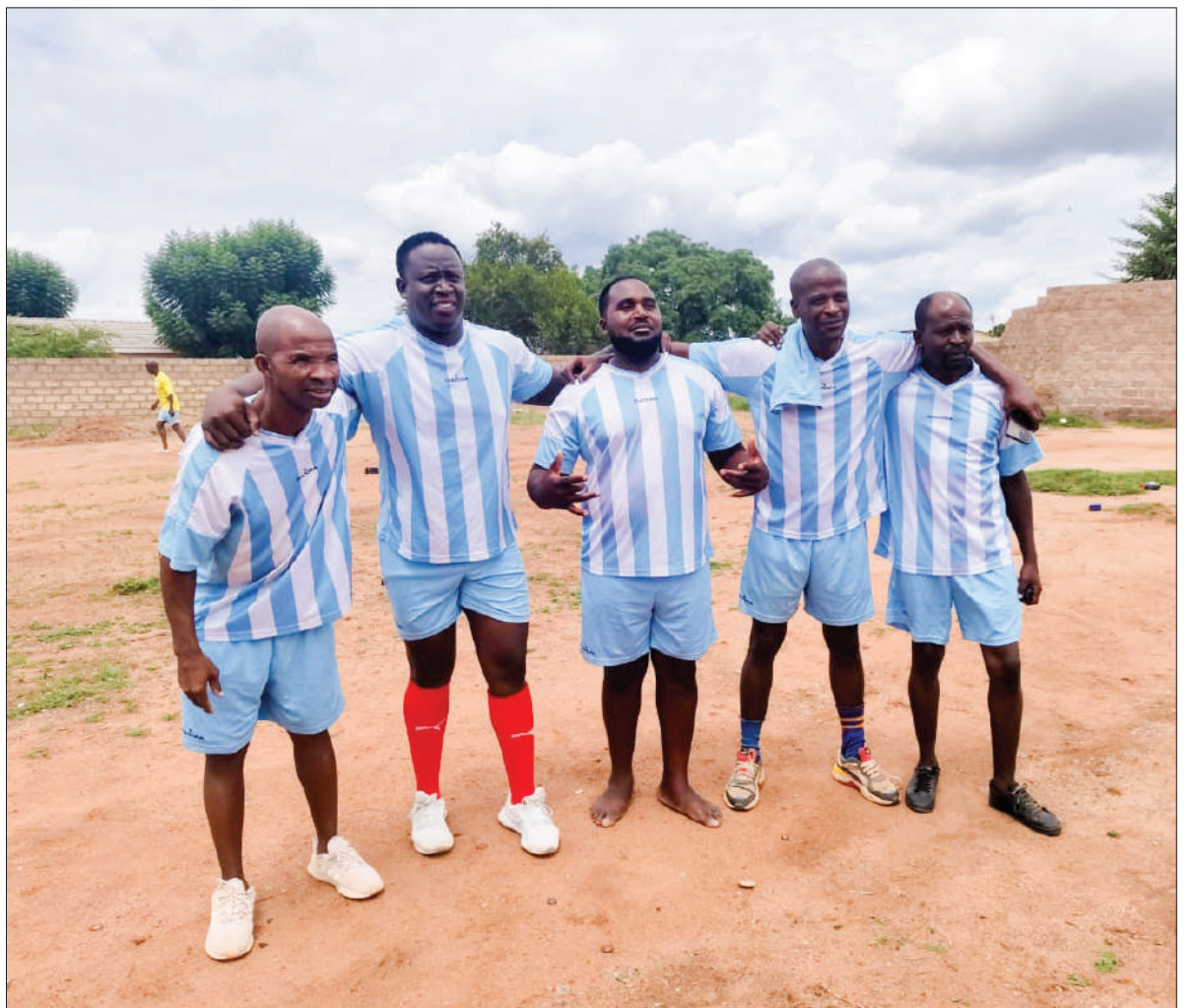
Fandoza FC are among master soccer teams participating within the Old Croks Soccer Tournament in Dennilton.