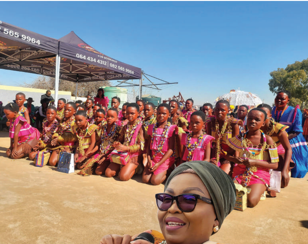
The newly graduated initiates during their welcoming ceremony at Ga-Mashabela Tribal Authority in Ga-Mashabela Village outside Jane Furse.