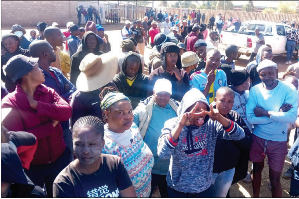
Scores of Luckau community members converged in numbers at Caltex Filling Station protesting to demand an immediate address of their poor service delivery complaints.