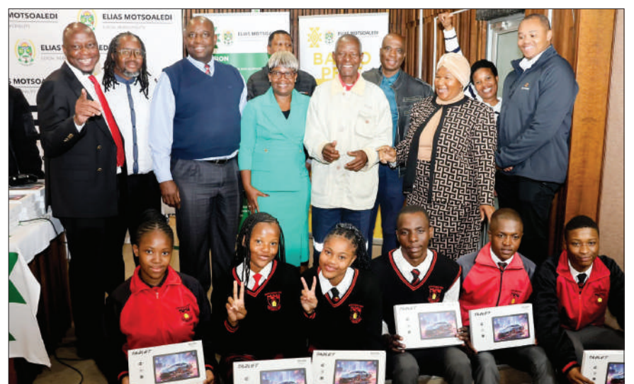
Benefiting learners after they received digital tablets posing with some of EMLM employees after the donation hand-over.

"The lack of reliable access to digital learning poses the greatest obstacle to our disadvantaged learners," he said.