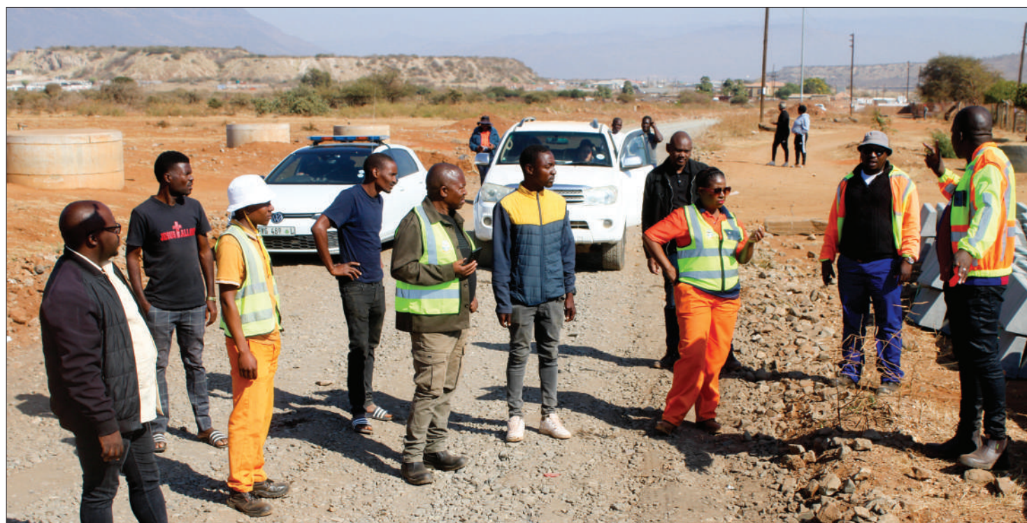
Mayor and the Executive Committee inspect the access road at Dresden.