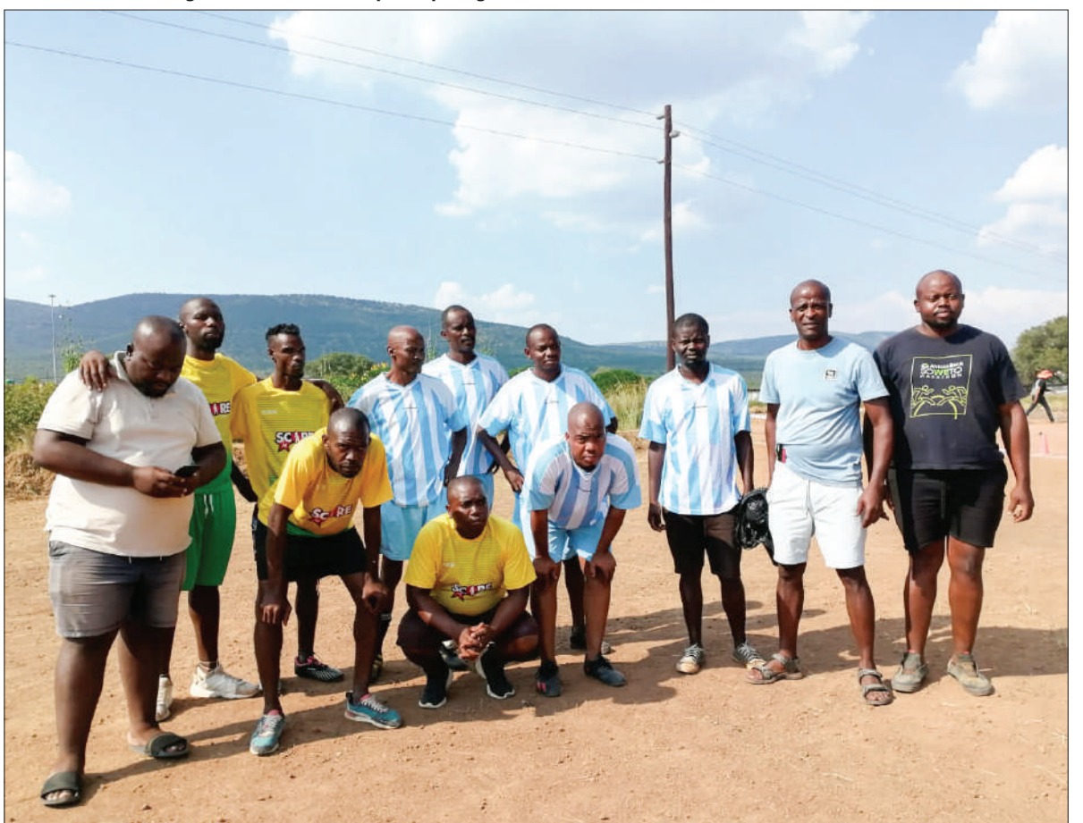
Black Door FC (Wearing yellow), with Corona FC (Wearing blue) just before they face each other during the Old Croks Soccer Tournament in Dennilton.